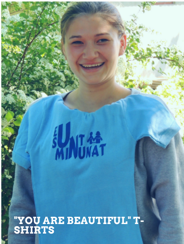
"YOU ARE BEAUTIFUL" T-SHIRTS

We gave out personalized t-shirts and hats with the message "you are beautiful." We spoke about the value of education as their key for future success and how to protect themselves from the dangers of human trafficking.