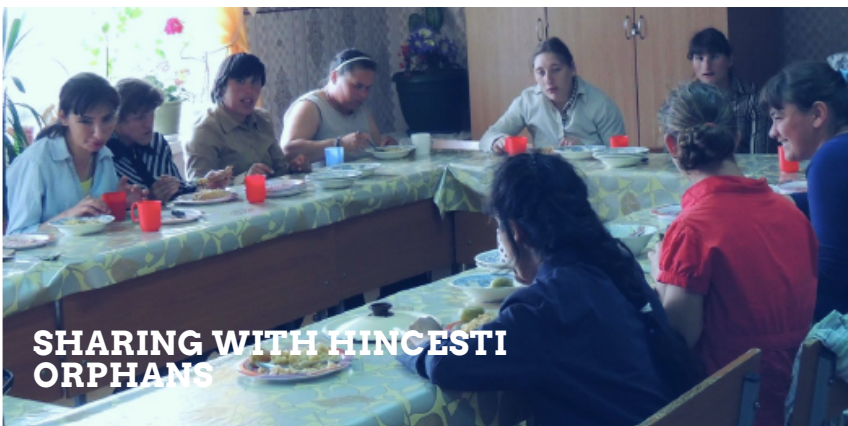
SHARING WITH HINCESTI ORPHANS