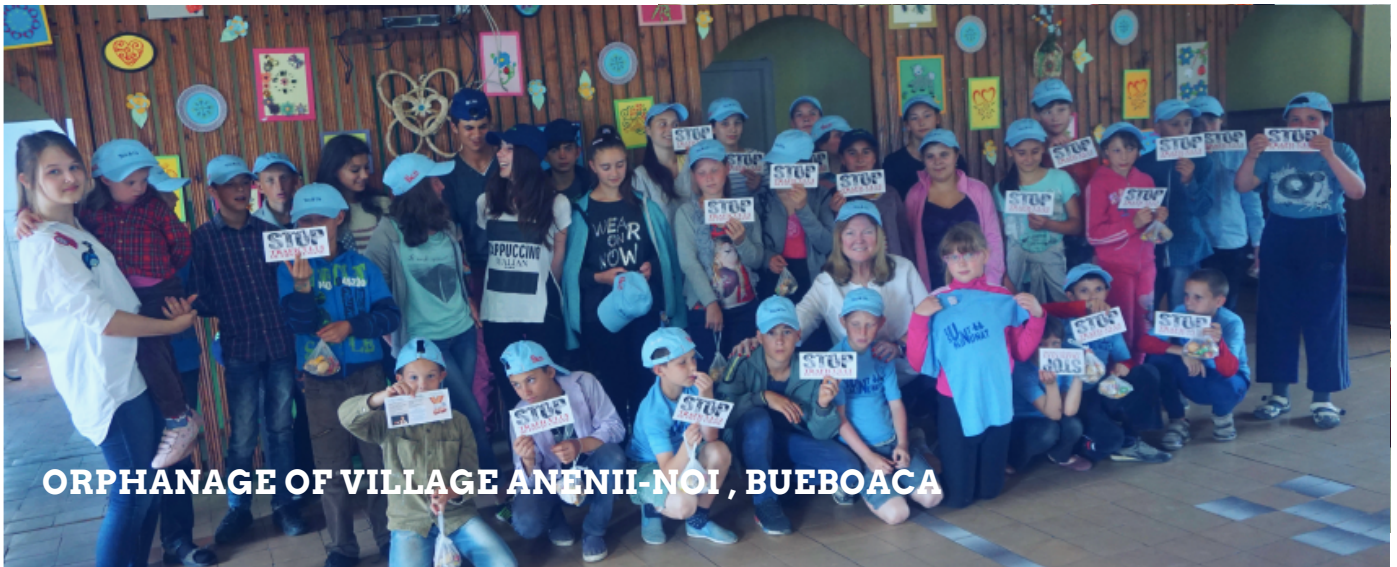
ORPHANAGE OF VILLAGE ANENII-NOI , BUEBOACA