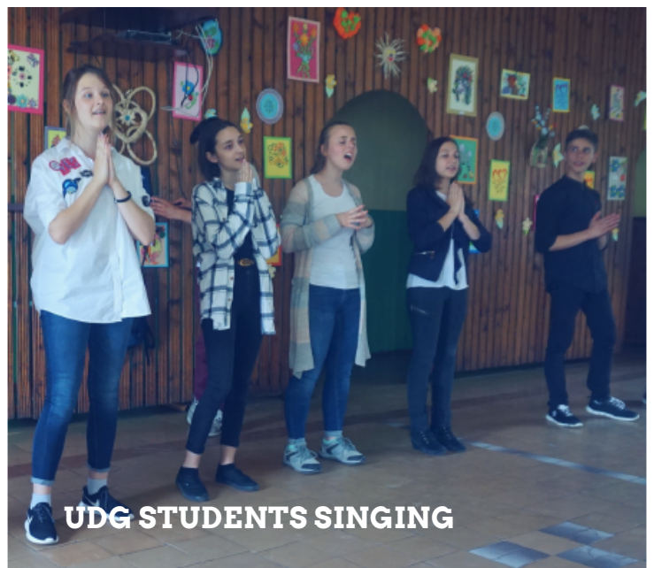
UDG STUDENTS SINGING