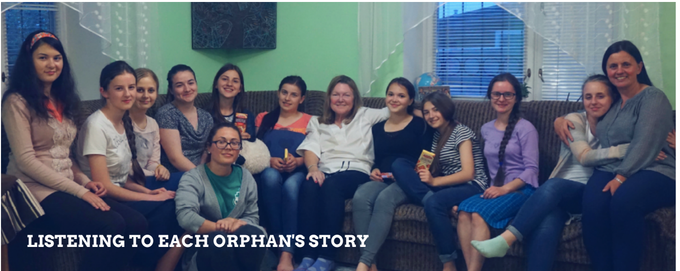
LISTENING TO EACH ORPHAN'S STORY