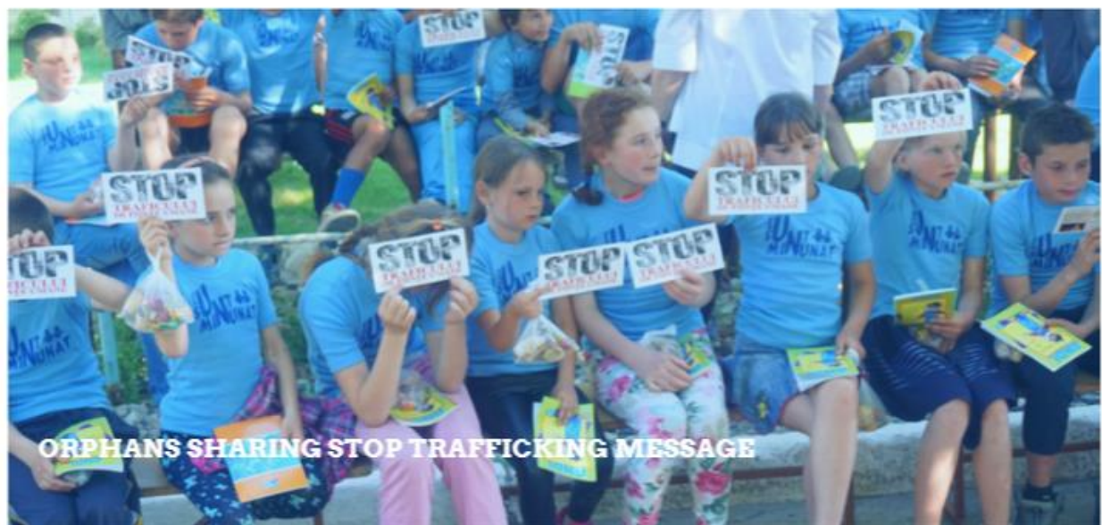
ORPHANS SHARING STOP TRAFFICKING MESSAGE