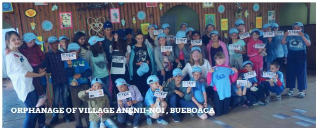
ORPHANAGE OF VILLAGE ANENII-NOI , BUEBOACA