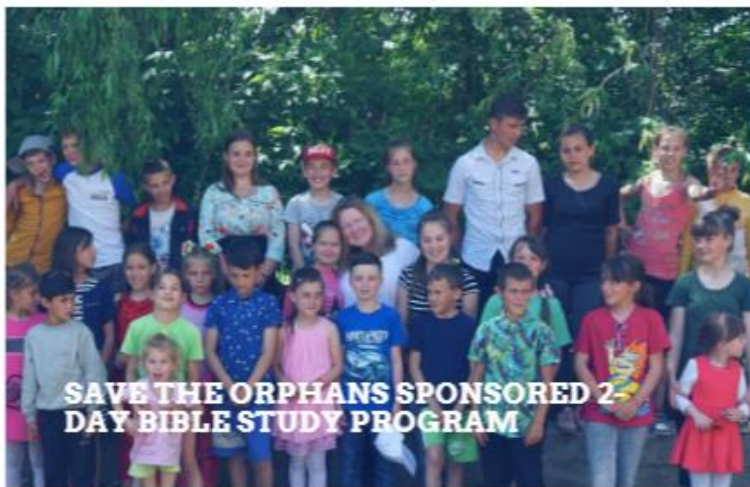
SAVE THE ORPHANS SPONSORED 2-DAY BIBLE STUDY PROGRAM